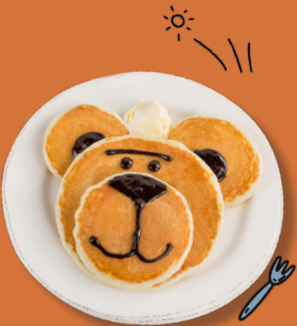
Jr. Bear Pancakes

Jr. Waffle Breakfast* ..... 8.99 One egg, one strip of bacon, and three mini waffles