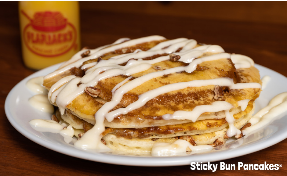
Sticky Bun Pancakes*

Nutella and Banana Pancakes ..... 10.99 Banana filled buttermilk pancakes topped with Nutella and fresh sliced bananas